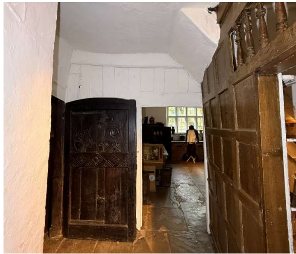
The Little Parlour Chamber and the lobby accessing the New Parlour and the back Kitchen Stairs at the Hall, with visible 16th-century timber framing