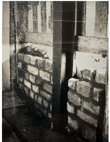
Some of the archival images of framing that are now hidden behind 17th-century panelling will be available on the study days, along with others.